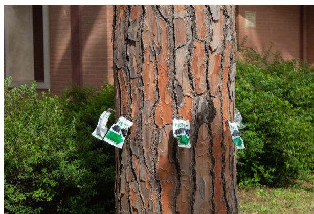
Figure 1. Endotherpic abamectin treatment on stone pine plants. Injection through the pressurized bags into the plant trunk.

After the date of the endotherpic treatment, six 20 cm-long twigs were randomly collected by reaching into the canopy of each treated and untreated plant with a basket crane and sampled fortnightly. After the cut, each twig was sealed into a plastic bag, brought to the laboratory and inspected within 24 h. Additionally, two other twigs were randomly collected by the treated plants and designated to multiresidue analysis.